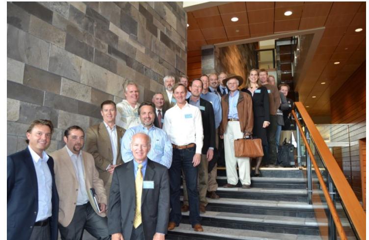
Technology and Innovation KIN